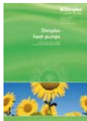
Heat pumps brochure