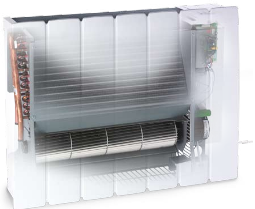
White metal fronted SRX140M with left hand side plumbed connections.

An added benefit of SmartRad is that it allows flexible left or right handed plumbing connections, or even 'invisible' through the wall connection, offering complete flexibility over installation, particularly in retrofit situations.