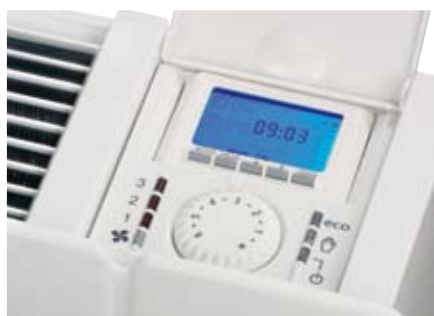
White metal fronted SRX180M with left hand side plumbed connections.