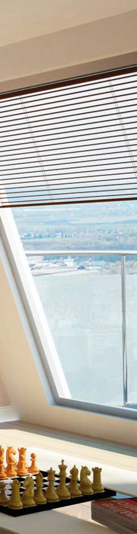
SRX180BG in contemporary black glass finish. Pipework is hidden by through the wall plumbing connections.