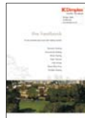
Domestic heating brochure