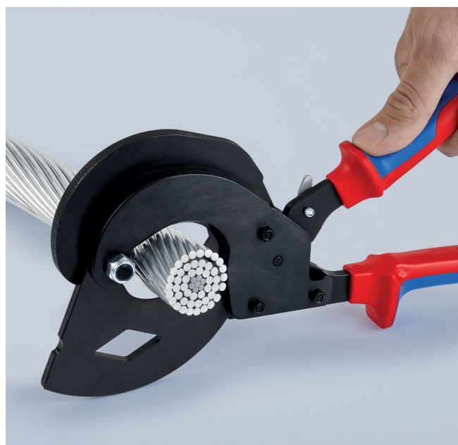
The strong "flange" on the handle can be used as a practical support when cutting larger diameters