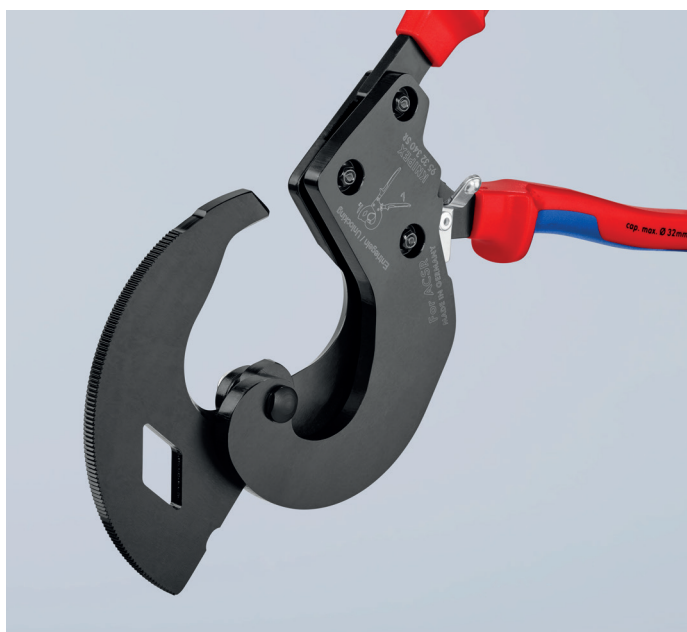
Enormous power with a weight of just 1300 g