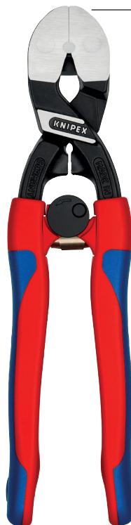
View of the back of the pliers