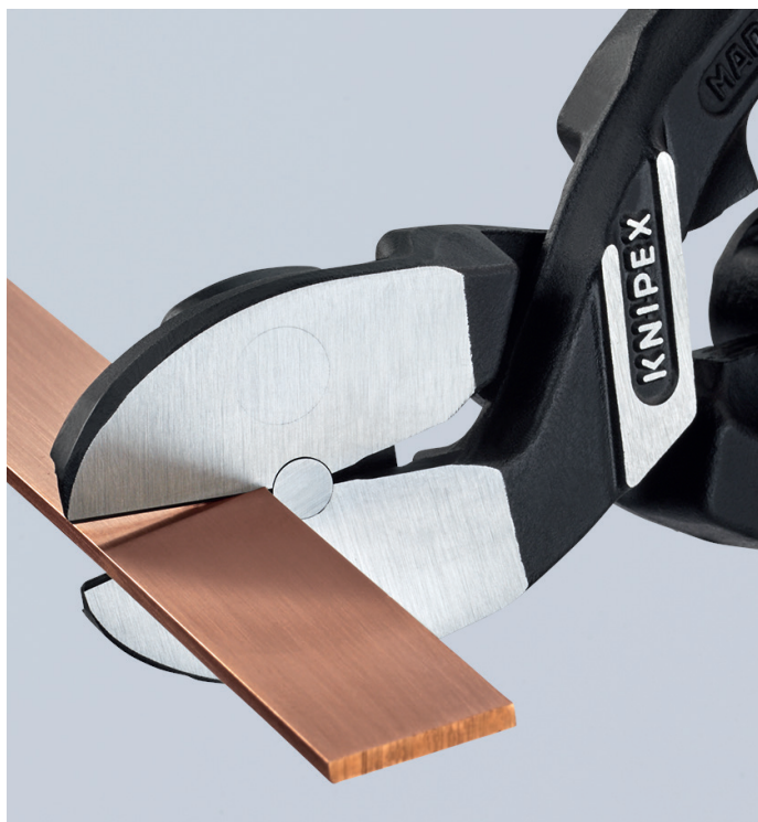
Copper busbars are cut cleanly and flush