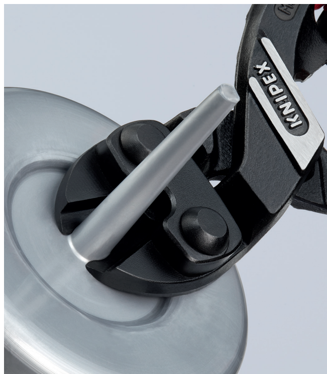
Ideal for the flush cutting of plastic sprues with large diameters