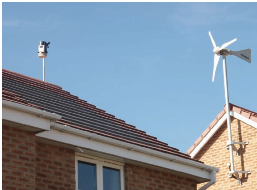
Fig 1: A wind generator. The pole mounted unit on the roof of the first house is a weather station which can measure wind speed and rate of solar radiation (insolation) and the dark PV tiles are integrated with the red roof tiles.

generating set used as an additional source of supply in parallel with another source shall either be installed on the supply side of all protective devices for the final circuits of the installation (connection into a separate dedicated circuit) or if connected on the load side of all protective devices for the final circuits must fulfil a number of additional requirements.