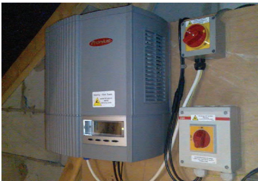
Fig 3: Inverter unit installation

isolated before starting work. A further risk involves working at height on a roof for example together with the manual handling associated with a PV installation. Finally, PV installations require expertise in dc wiring and fault protection for d.c. side of the installation.