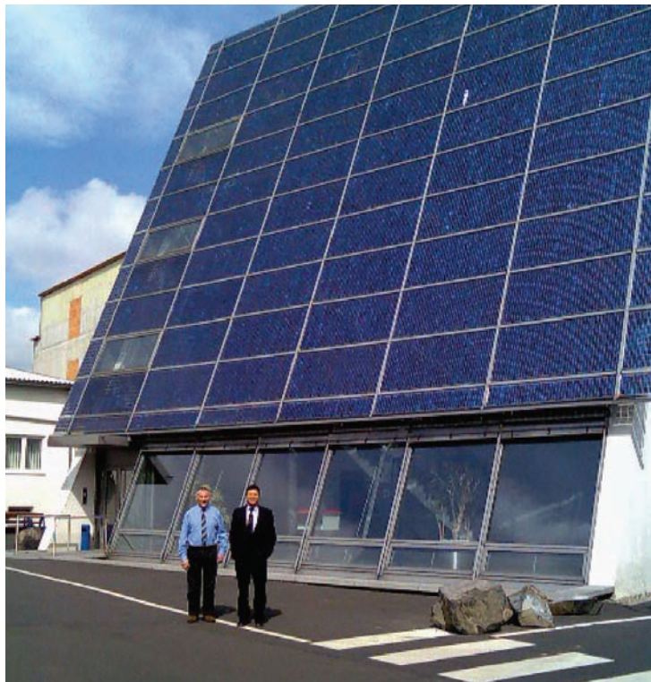
Fig 4: A large building with an integrated PV system

712.411 gives requirements for the protective measure, automatic disconnection of supply. Where this method of protection is used on the a.c. side, the PV supply cable shall be connected to the supply side of the protective device for automatic disconnection of circuits supplying current-using equipment. Regulation 712.412 gives requirements for the protective measure, double or reinforced insulation and states that protection by Class II or equivalent insulation shall preferably be adopted on the d.c. side.