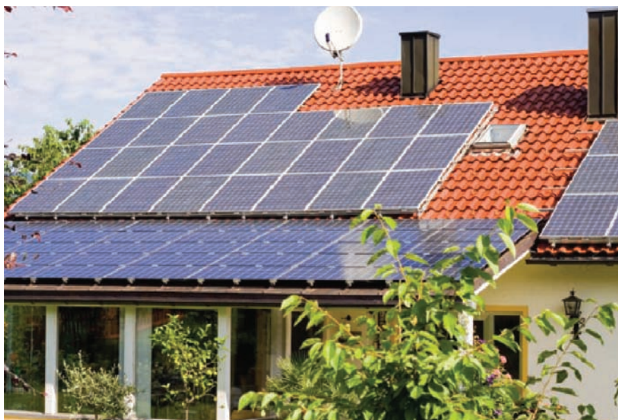
Fig 5: Roof mounted PV installation