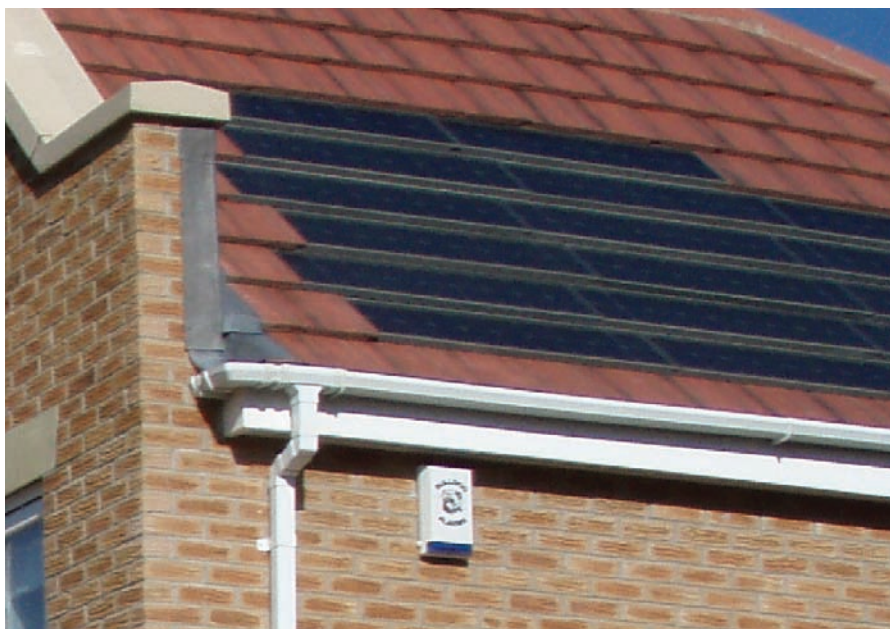
Fig 2: Dark PV tiles are integrated with the red roof tiles.