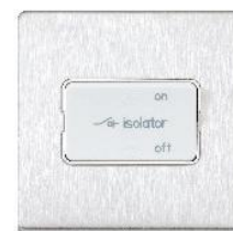
Figure 2: Three-pole isolator which can be locked off.

(e) proving dead. In some cases additional precautions will also be needed. Please refer to the HSE publication: Electricity at Work: Safe Working Practices.