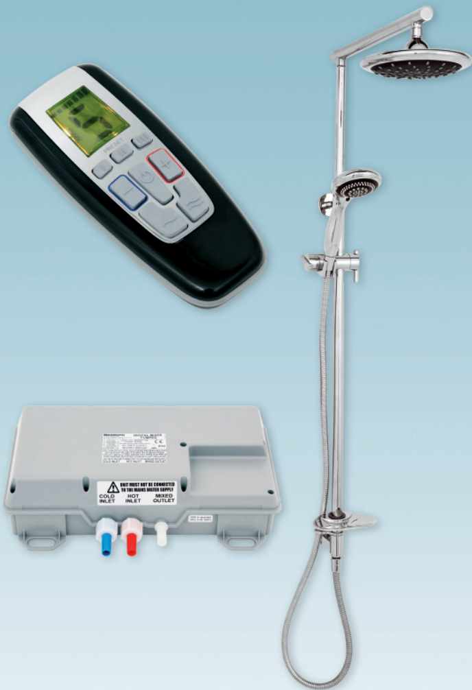
Portia Accessory Kit shown